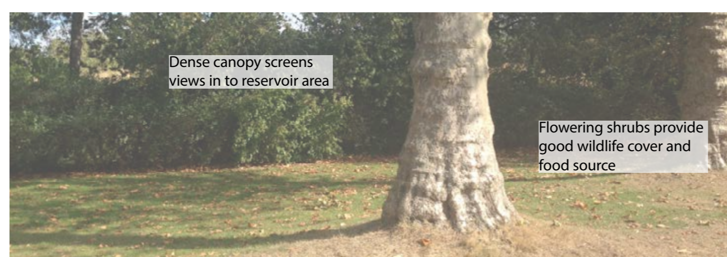
The Old Reservoir