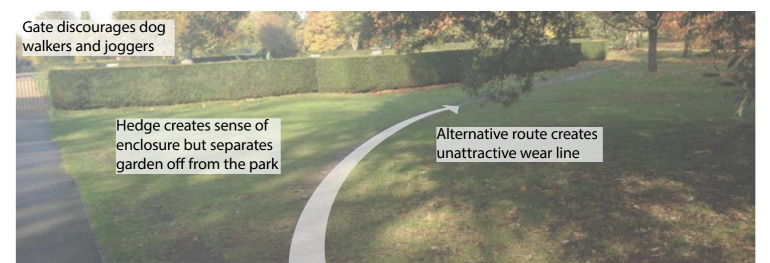
The Rose Garden