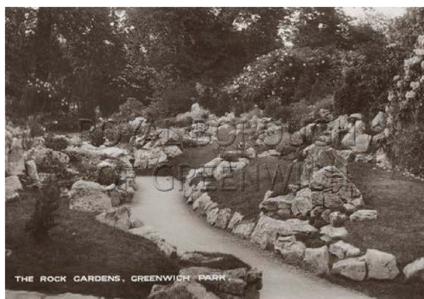
The Rock Garden, Greenwich Park. Postcard, circa 1905. Grassed areas punctuated with specimens and linear rock layout.