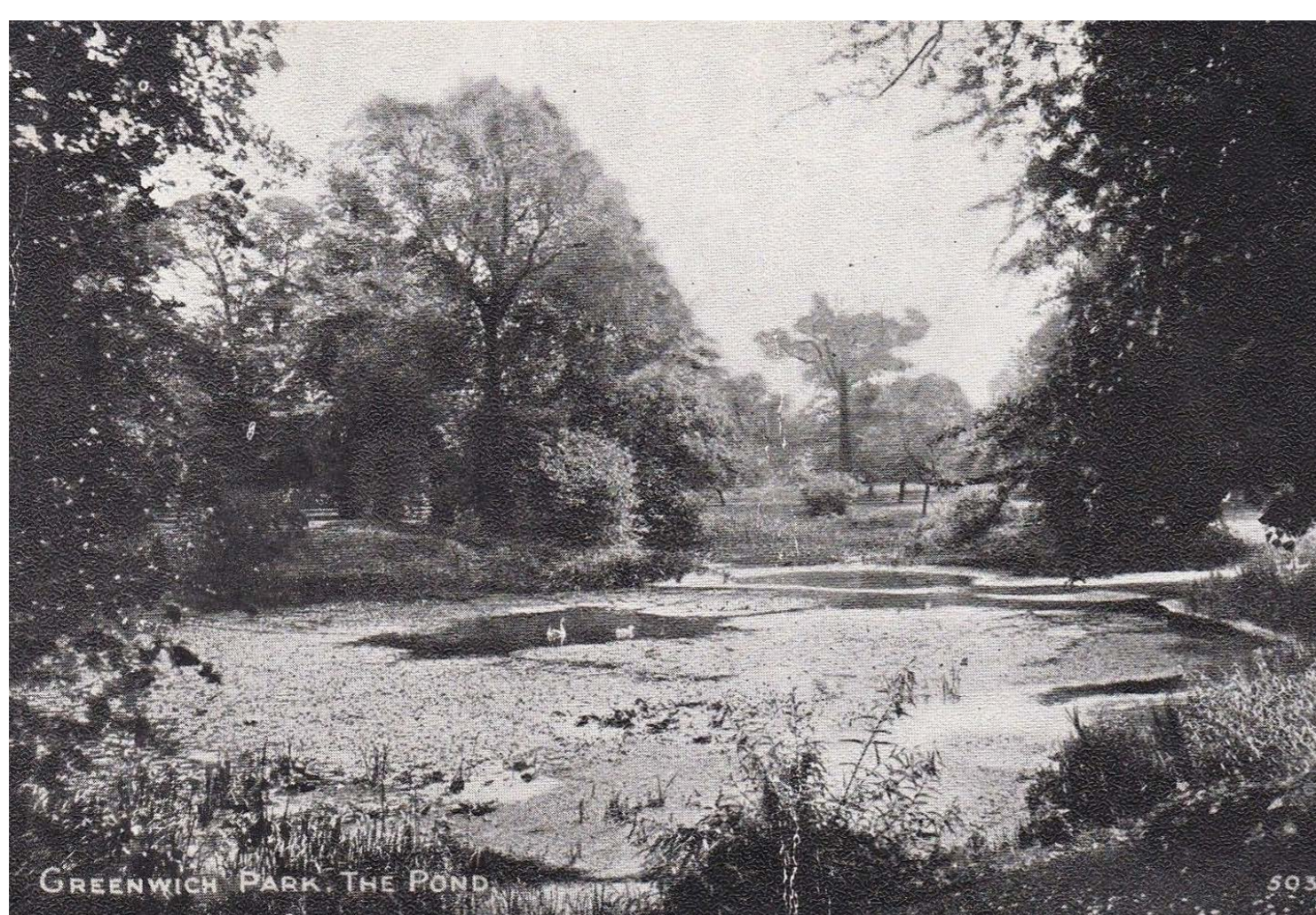
The pond at Greenwich Park. Postcard, circa 1922. Naturalistic, with clear views through parkland.