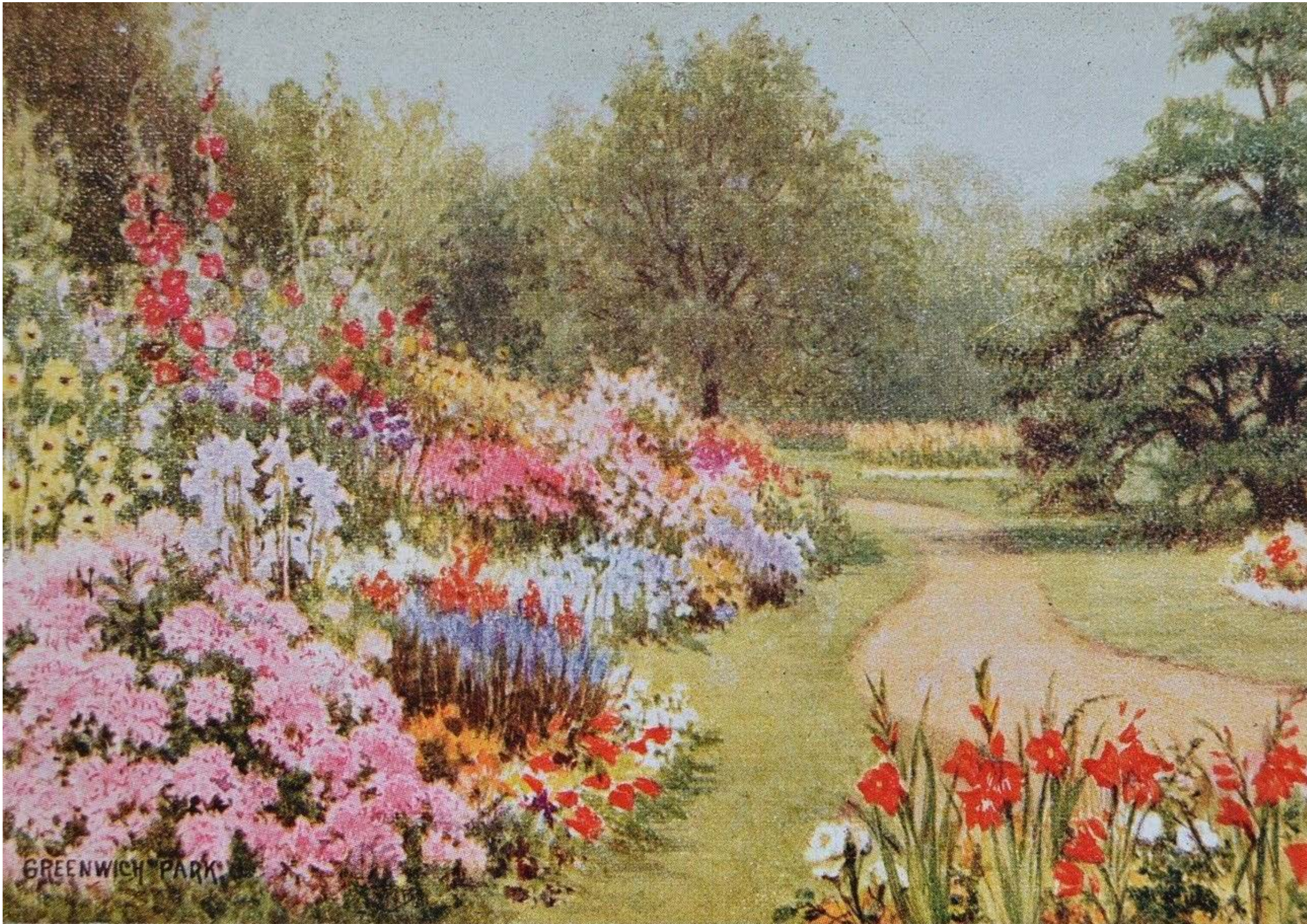
Greenwich Park. Postcard, circa 1945. Traditional mixed perennial border