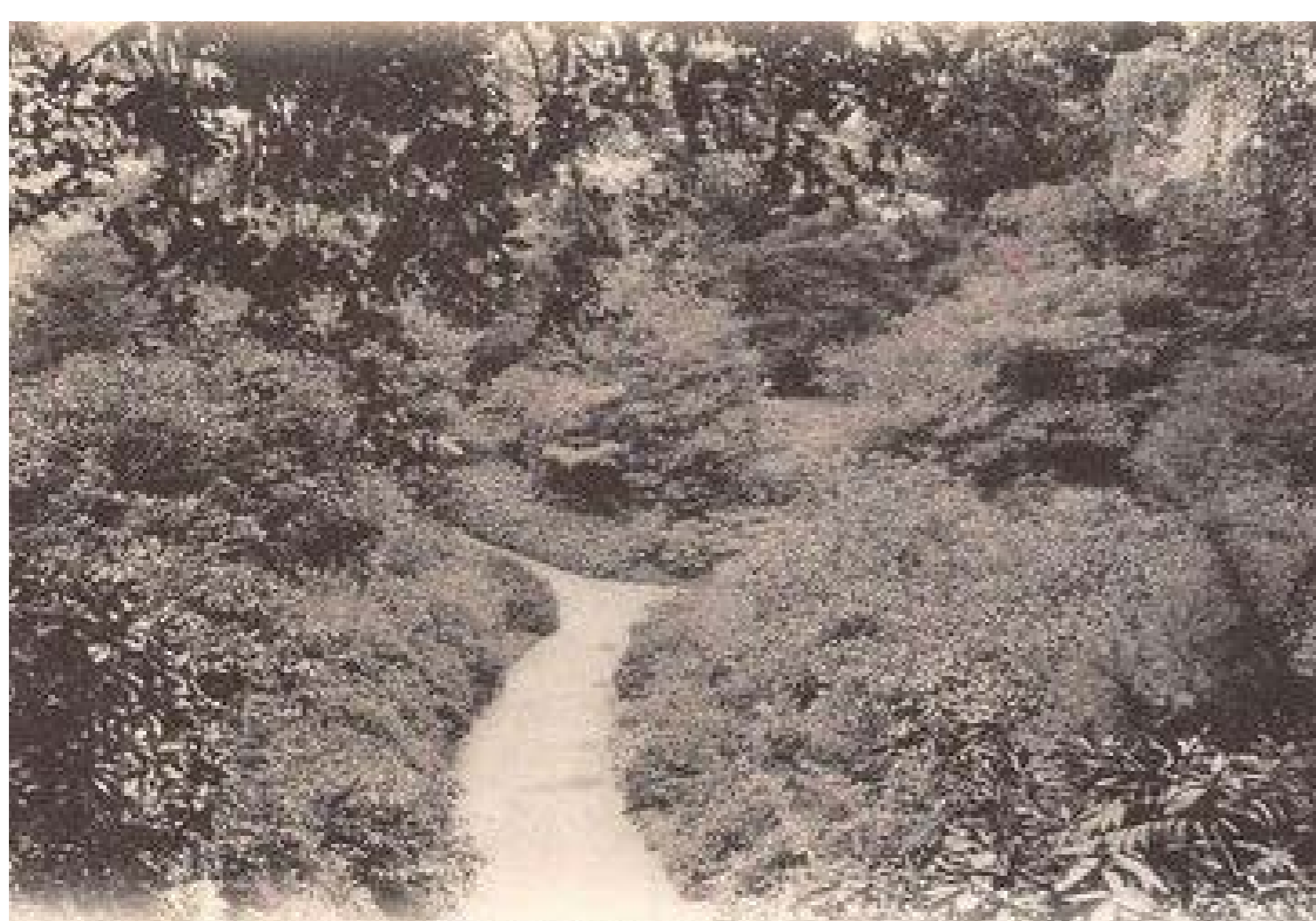
In the Dell, Lodge Grounds, Greenwich Park. Postcard. Diverse shrub planting.